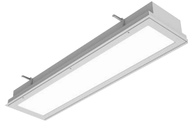
1' x 4'