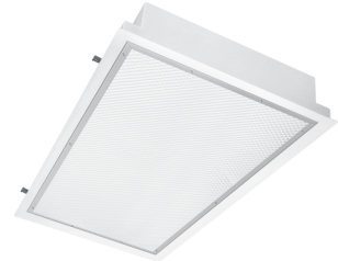
2' x 4'