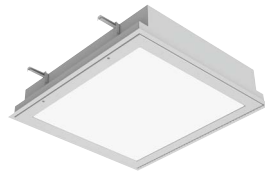
2' x 2'