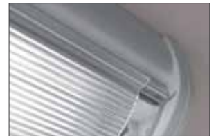
Diecast end caps and lens effectively and uniquely seal against the elements with a closed cell extruded gasket.