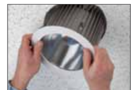
Tool-less access with hidden spring clips for easy relamping and maintenance.