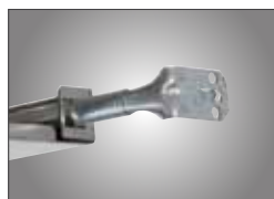
Adjustable mounting frame for precise luminaire positioning, strength and durability.