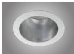
Fully gasketed, sealed regressed lens and optical chamber.