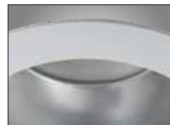
Marine-grade, die cast aluminum trim ring available in a variety of finishes.