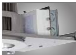
LED Driver offers flexible dimming capabilities ranging from 5%-100%.