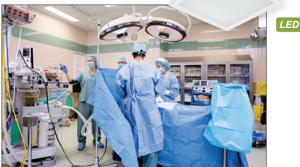
White Disinfection Mode

White disinfection mode provides ambient lighting and continuous environmental disinfection while room is occupied