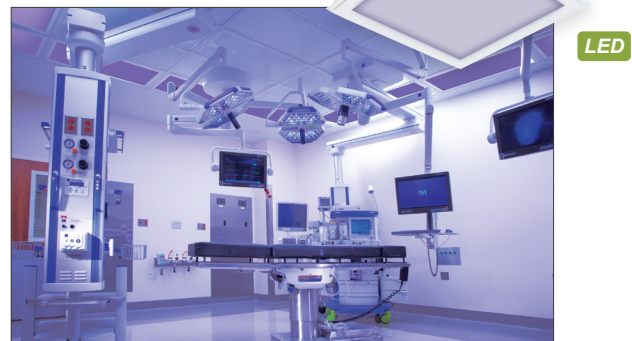
Indigo Disinfection Mode

Indigo disinfection mode can be selected to provide maximum continuous disinfection when room is not in use