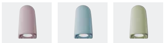
Designer colors available