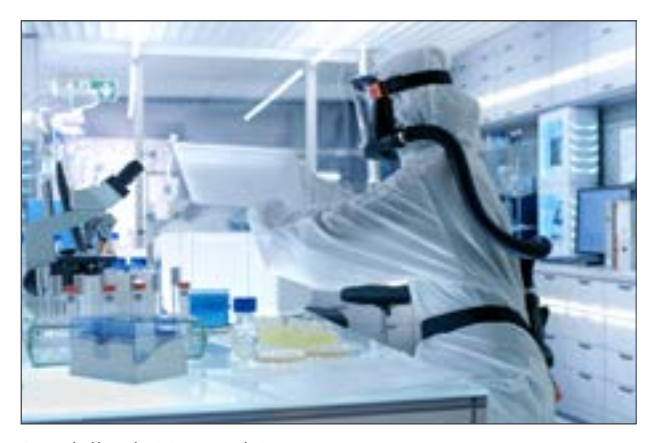
Specialized ISO-Rated Space

Cleanrooms are facilities dedicated to specialized industrial manufacturing or scientific research. Typical cleanroom owners produce pharmaceuticals, integrated circuits, and LED monitors and televisions. Food processing facilities are highly driven by the need to keep food free from contamination, so cleanrooms are often utilized for these applications.