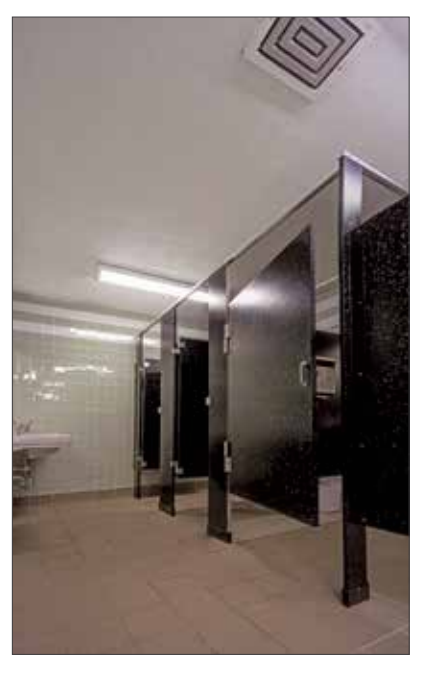
Millenium Stretch with Indigo-Clean Technology promotes a cleaner environment in the swimming pool locker room at Mosely High School

For more information, please visit us on the web at www.kenall.com