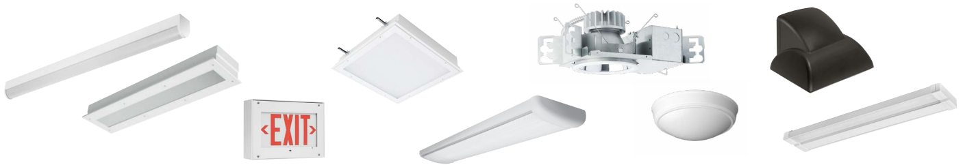
Left to right: EnviroSeal™ ES3; MightyMac™ RMCA/RMCD; MME X Exit Signs; SimpleSeal™ CSEDI; Millenium™ Stretch MLHA, Downlight HADL, Round MR17, Finite FN9 and FN15; and Stratalume™

Fulton State Hospital (FSH) has been a fixture in mid-Missouri since 1851, but in 2014, the oldest psychiatric hospital west of the Mississippi was in desperate need of replacement. Home to high and low security psychiatric patients, developmentally disabled clients and a Sexual Offender Rehabilitation and Treatment Service program (SORTS), FSH operated in 1930s era buildings, with some equipment leftover from the Korean War.