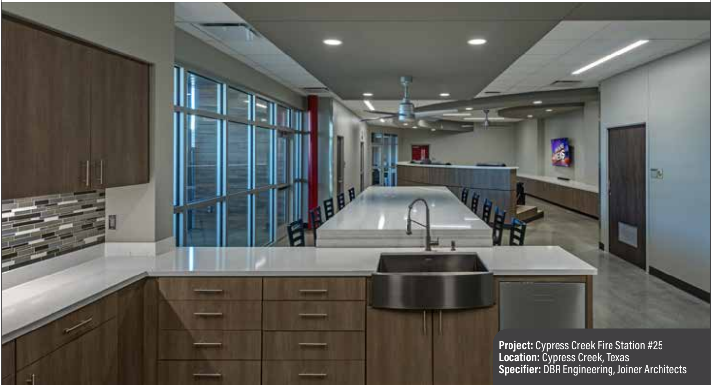
Project: Cypress Creek Fire Station #25 Location: Cypress Creek, Texas Specifier: DBR Engineering, Joiner Architects

The CCFD Station #25 project is one of many non-medical projects that value Indigo-Clean disinfection lighting, proving the technology is safe and effective for many types of settings, including schools, universities, health clubs and offices.