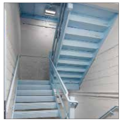
Millenium Round and MOS fixtures in the Brookyn Battery Garage

For more information, please visit us on the web at www.kenall.com