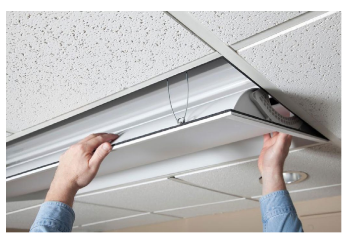
5. To return lens assembly back to closed position, push one long side lens assembly back into the housing, then holding on to the lens repeat on the other side.