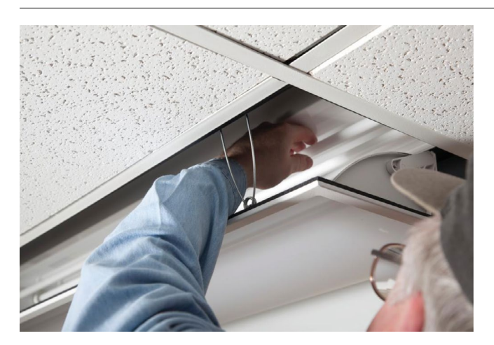
Re-lamp fixture with appropriate lamp wattage type or replacement gear tray.