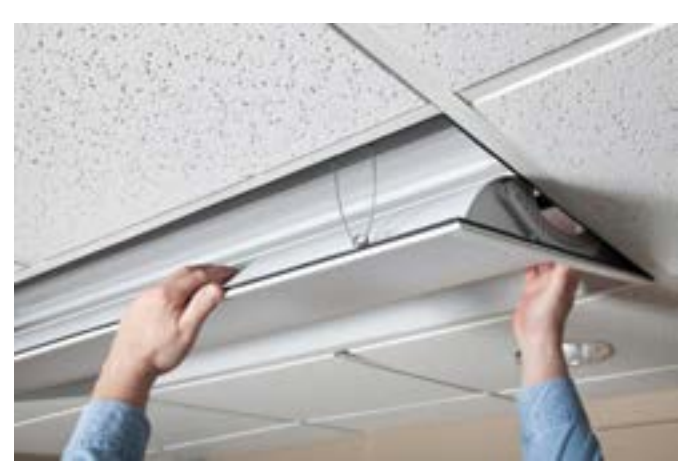
5. To return lens assembly back to closed position, push one long side lens assembly back into the housing, then holding on to the lens repeat on the other side.