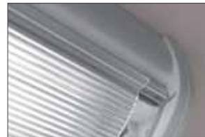
Diecast end caps and lens effectively and uniquely seal against the elements with a closed cell extruded gasket.