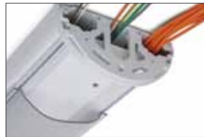
Suitable for use as a raceway.