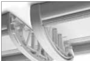
Individual or continuous row mounting.