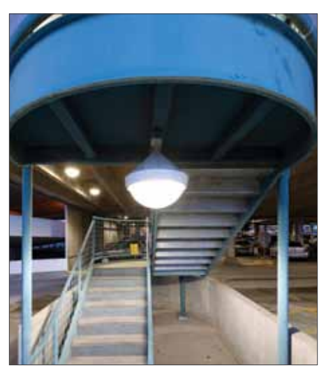
TekDek produces a brighter, whiter light, making it easier for travelers to see their cars and feel safer at night.

The first phase included running conduit, wiring and a control system to prepare the parking garage for Phase II of installing the new lights. In a one-for-one replacement, 150W high pressure sodium (HPS) fixtures were retrofit with 80-watt TekDek LED luminaires.