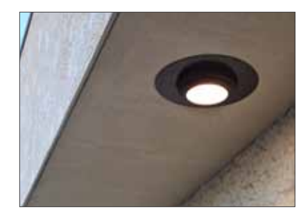
A custom trim ring covers a gap around the luminaire that was left when the larger HID was removed.

The new luminaires are constructed of environmental-and-impact-resistant materials such as marine-grade aluminum housings, UV-resistant polycarbonate lenses and lens bases, stainless steel fasteners, and extruded closed-cell gasketing.