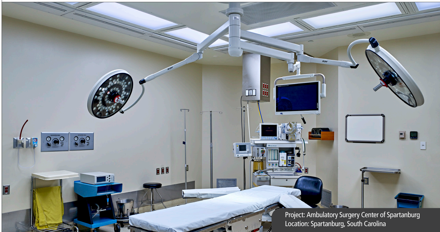
Project: Ambulatory Surgery Center of Spartanburg Location: Spartanburg, South Carolina

“We wanted a disinfectant technology that would be effective, efficient and easy to use which is exactly what Indigo-Clean is. Compared to other disinfecting technology on the market, Indigo-Clean was the most cost effective and efficient since there was no room downtime, and because it’s automatic, it alleviates the concern of training and human error.”